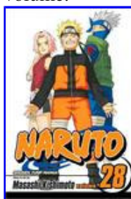
Naruto GN 28

Delivers enough tension, shifting relationships, and little emotional zings to ensure that viewers will tune in for the final volume.