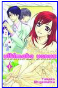
Ultimate Venus GN 1

Too often, shoujo manga about a normal girl who enters the world of the wealthy elite becomes less about her and more about all the dreamy dudes she meets along the way. Ultimate Venus , on the other hand, is true to its title with the way it puts the protagonist at the summit of the narrative agenda. Yuzu is a great character, and she is that one that captures the imagination here. If you love strong manga heroines, check this one out!