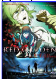
Red Garden DVD 5

Readers of Alive may have been worried that the story was slowly devolving into a "Who will Taisuke fight next?" psychic-power tournament series. Fortunately, Volume 5 defuses those worries with an intriguing shift in direction.