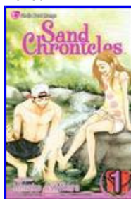
Sand Chronicles GN 1-2

Naruto's heretofore white spine has become black, and Naruto is back! Volume twenty eight corresponds to the beginning of the Naruto: Shippûden anime series, and although you cannot really begin the series from this point and expect to understand or appreciate everything that occurs subsequently, there is a genuine sensation of reinvigoration to be found here.