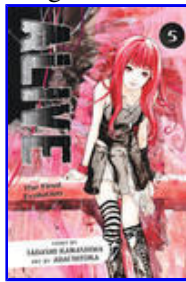
Alive GN 5

Too often, shoujo manga about a normal girl who enters the world of the wealthy elite becomes less about her and more about all the dreamy dudes she meets along the way. Ultimate Venus , on the other hand, is true to its title with the way it puts the protagonist at the summit of the narrative agenda. Yuzu is a great character, and she is that one that captures the imagination here. If you love strong manga heroines, check this one out!